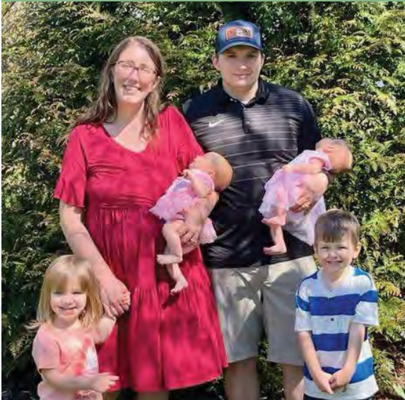
The Fetty family.